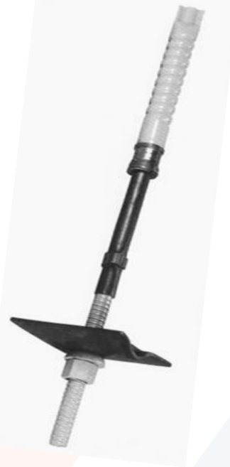
Figure 1. Garford dynamic bolt

(acceptance of stresses on the walls (roof) of the underground mine working)